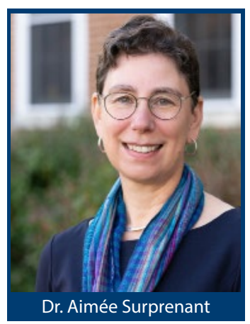
Dean for Graduate Education