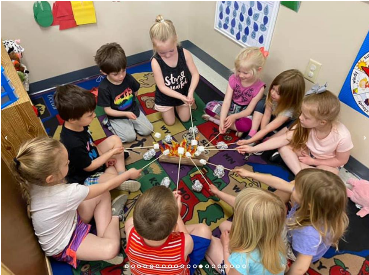
Preschool class at Children’s Nest Childcare center in Blacksburg